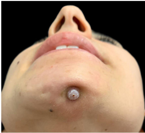
Figure 1 Erythematous nodule with surrounding retraction on the chin.

A 27-year-old female patient presented with a six-month history of a persistent and painful nodule on the chin. She referred occasional purulent exudate. There was no history of fever or systemic symptoms. Several courses of oral antibiotics had been ineffective. In the extraoral examination she presented an erythematous nodule with an important surrounding retraction (Fig. 1). Ultrasonography (Esaote MyLab Gamma®, 18 MHz) revealed a hypoechoic