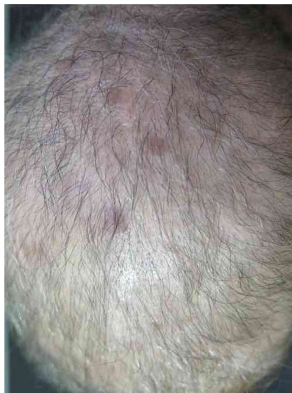
Figure 1 Scalp lesions.

Myeloid sarcoma, chloroma, or granulocytic sarcoma is defined by the World Health Organization as a solid tumor consisting of myeloblasts occurring in an anatomical site other than the bone marrow. Therefore, it should be remembered as a differential diagnosis of any atypical cellular infiltrate. 1 In addition, it is a rare tumor, with an incidence of two in every 1,000,000 inhabitants, and is difficult to diagnose. This disease has great association with myeloproliferative diseases, especially with acute myeloid leukemia, and may be the first manifestation of the disease in 5% of cases. Cutaneous manifestations are more often seen as hardened, purplish, purpuric-based nodules, about 1–2.5 cm in diameter and more rarely as plaques, erythematous macules, blisters, and ulcers; they may present as an erythematous rash in a polymorphic pattern. It more commonly presents as a solitary lesion in places like soft tissues, bones, peritoneum, and lymph nodes. In the case reported, the lesion was present on the scalp, a rare site of dis-