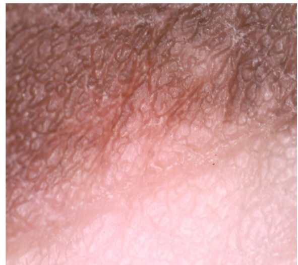
Figure 2 Border of a lesion on dermoscopy, showing reduced pigmentary network in the lesion compared to normal skin.