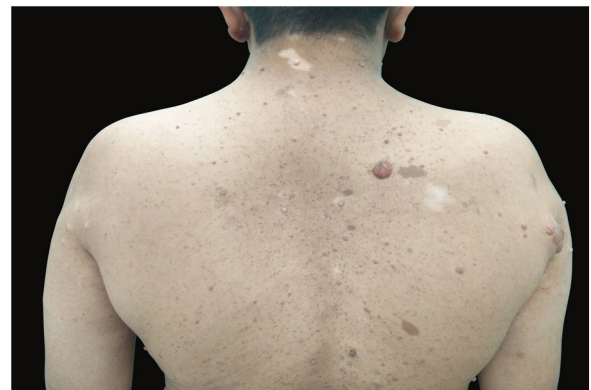
Figure 1 Café-au-lait macules, neurofibromas with perilesional halo, and vitiligo patches over the back.

brother. On cutaneous examination, multiple dome-shaped, skin colored papulonodular lesions of variable sizes and soft in consistency were present over the face, trunk, back, and extremities. Some nodules had depigmented halo around them. Multiple well-demarcated, light brown colored patches, 5–20 mm in size, were present over back, chest and upper extremities. Sharply demarcated patches of depigmentation suggestive of vitiligo, along with freckles, were present in both the axilla and over the trunk and