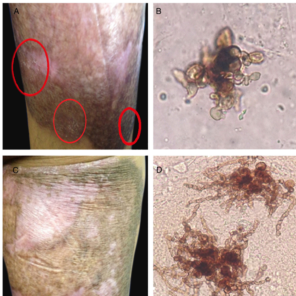
Figure 3 Six months of therapy with itraconazole. (A) Plaque border with fine scaling, and black dots. (B) Sclerotic cells with emission of short filaments or “Borelli spiders”. One year after treatment with itraconazole. (C) Scaling on the superior border of the plaque. (D) Sclerotic cells with emission of long filaments or “Borelli spiders”.

was deposited in the GenBank database ( Rhinocladiella aquaspersa Access No. MG996793).