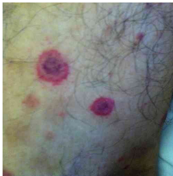
Figure 3 Cutaneous vasculitis on the leg of a 42-year-old man with a history of cat scratches and fever, with a diagnosis of B. henselae endocarditis confirmed by polymerase chain reaction, serology, and culture.

It has been suggested that the difference between the angiogenic and granulomatous response triggered by the organism observed in BA and CSD, respectively, appears to be determined by the degree of the host's immunocompetence. 51,52 The concurrence of lesions with clinical and pathological features of CSD and BA, also reported after the use of corticosteroids, with the