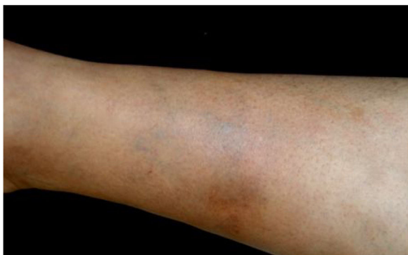
Figure 5 Sclerosing panniculitis with recurrent anemia. Sclerosing panniculitis in the right leg of a 32-year-old woman with a history of recurrent anemia of unknown origin. The patient subsequently tested for positive B. henselae DNA in blood samples.

with deflazacort 7.5 mg/d, methotrexate 15 mg/week and hydroxychloroquine 400 mg/d for 2 years, with a diagnosis of sarcoidosis. The anatomopathological examination of the skin was compatible with annular granuloma. B. henselae DNA was amplified in a fragment of a mediastinal lymph node and in the patient's blood.