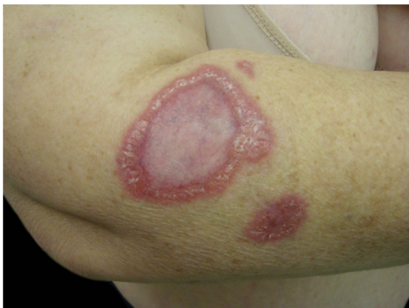
Figure 4 Annular granuloma presented by a 52-year-old woman. B. henselae DNA was amplified in a fragment of the mediastinal lymph node and in the patient's blood.