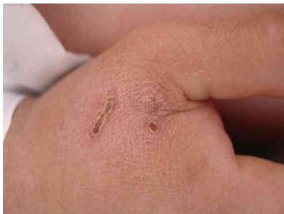
Figure 1 Lesions caused by cat scratches presented by a 28-year-old man with Bartonella sp. infection detected by polymerase chain reaction.

is through body lice, the reason why this pathogen is strongly associated to unsanitary conditions and poor personal hygiene. 31 The disease is also known as quintana fever or five-day fever, and it has an incubation period of 15–25 days. TF can be asymptomatic or severe. Approximately half of those affected experience a sudden onset of flu-like symptoms with no respiratory symptoms and short duration. High and prolonged fever can occur over several weeks. Symptoms remit for many days and after an asymptomatic period there can be paroxysmal clinical exacerbation three to five times or more within a year. 30 Eighty to 90% of patients present with erythematous, maculopapular lesions of up to 1 cm on the trunk. 32 Furred tongue, conjunctival congestion, and musculoskeletal pain are frequently associated. 33