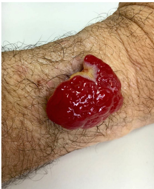
Figure 1 Exophytic erythematous nodule, measuring about 4.5 cm in left forearm.