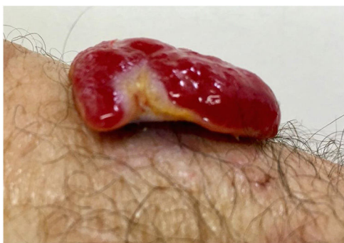
Figure 2 Pedunculated tumor.