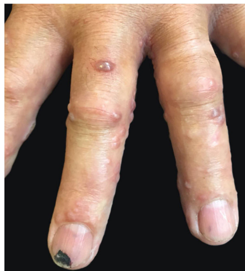
Figure 1 Multiple vesicular lesions affecting the left forearm and left hand.

We report a case of concurrent reactivation of VZV and HSV in an immunocompetent elderly male with no clinical history of herpes simplex but with serologic evidence of past infection. The combination of high sensitivity and specificity, low contamination risk, and speed has made