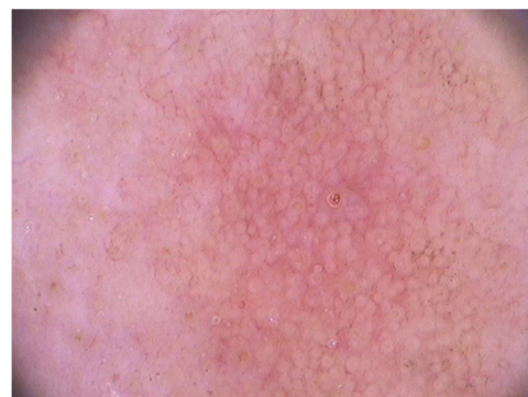
Figure 3 Dermoscopic image (FotoFinder®, x20) of the “strawberry” pattern observed in facial actinic keratosis.

Dermoscopy is a fast-performing, noninvasive method that helps in the diagnosis of actinic keratoses and allows them to be differentiated from their differential diagnoses; moreover, actinic keratoses have well established dermatoscopic criteria. Dermoscopy has high sensitivity and specificity for the diagnosis of actinic keratoses, with values of 98.7% and 95%, respectively. 83,84