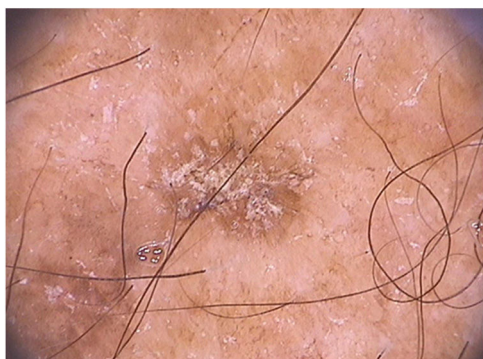
Figure 5 Dermoscopy of extra-facial pigmented actinic keratosis located on the forearm: homogenous brownish pigment with whitish scales on the lesion surface can be observed (FotoFinder®, x20).