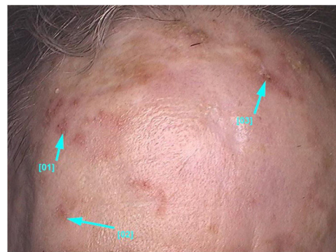
Figure 2 Non-pigmented facial actinic keratoses: multiple small papules and erythematous plaques with whitish scales on the surface and varying degrees of hyperkeratosis.

The development of actinic keratoses in immunosuppressed patients involves the factors previously described and aspects related to immunosuppressive medications that may even act as carcinogens, e.g., azathioprine. The medication causes direct damage to the DNA when the patient is exposed to UVA radiation, in addition to being photosensitizing. In the case of cyclosporin, carcinogenic effects occur through up-regulation of TGF- \beta . The scientific evidence available demonstrates an increased risk of developing SCC in patients using azathioprine, cyclosporine, tacrolimus, prednisolone, and mammalian target of rapamycin (m-TOR) inhibitors, such as sirolimus and everolimus. However, patients taking m-TOR inhibitors have a 51% lower risk of developing SCC when compared to patients taking cyclosporine or tacrolimus. 63 In addition, chronic immunosuppressive status affects the correction pathways of pre-oncogenic mutations. 57 The role of human papillomavirus in the skin carcinogenesis of immunosuppressed patients remains controversial and the proposed mechanism is not clear. 63 The risk of developing NMSC in the first five years after transplantation has significantly reduced in patients undergoing solid organ transplantation from 1983–1987 to 2003–2007. In the Norwegian population,