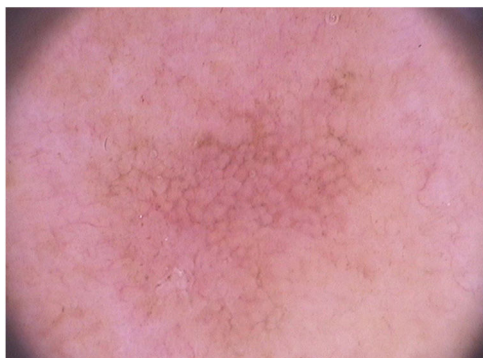
Figure 4 Dermoscopy of facial pigmented actinic keratosis (FotoFinder®, x20): a brownish pseudonetwork that spares follicular ostia is observed, in addition to surface scales and underlying vascular pseudonetwork.