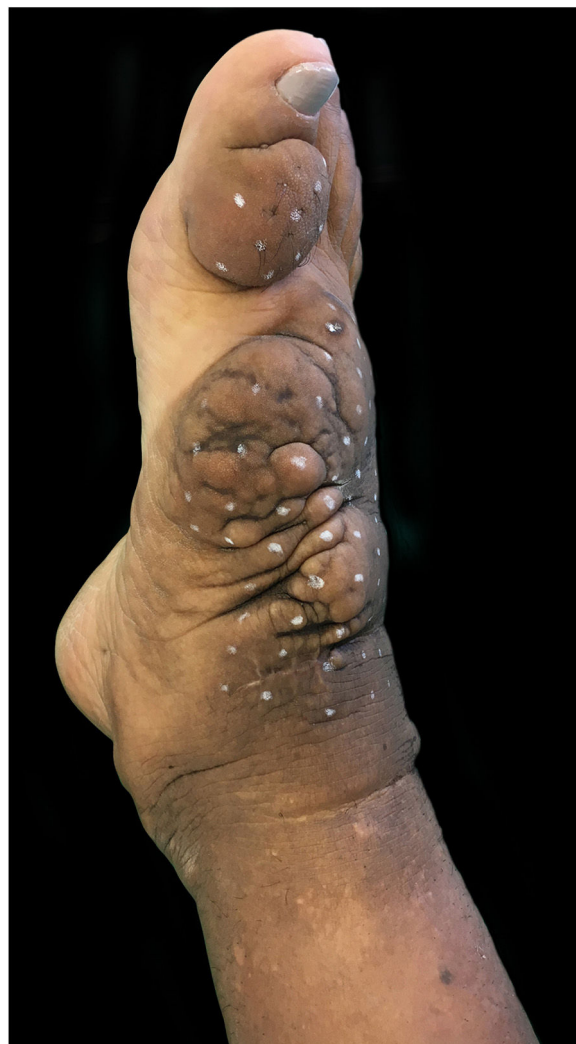
Figure 2 Clinical appearance of the right foot and ankle at the first session of intralesional application of corticosteroid. Non-depressible edema associated with hyperpigmentation reaching the lower third of the right limb, including lateral and posterior portions.

In light of confirmation of the clinical condition and the patient's desire to improve her appearance, a therapeutic program was established with the use of triamcinolone acetate 20 mg/mL without dilution, applied over 50 points, 0.1 mL per point deposited through a 26G 1/2 needle into the reticular dermis, with the distance between two application points standardized at 1.0 cm. The following areas were treated: dorsum and lateral region of the right foot, proximal phalanx of the right first toe, and the left ankle. The initial frequency of the procedure was monthly. After four months and based on a very satisfactory clinical response, the interval between applications was increased to bimonthly, with a reduction of the compound that was administered by 50%, maintaining a satisfactory clinical response.