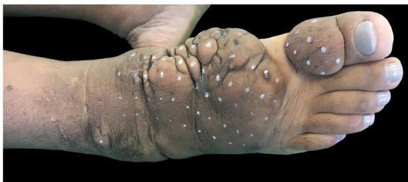
Figure 1 Clinical aspect of the right foot and ankle: confluent brownish nodules on waxy plaque. Hypertrichosis and hyperpigmentation are noted. First session of intralesional application of corticosteroid.

intravenous immunoglobulin, generating a mild to moderate response, with unpleasant results in severe cases. 1,4 The current article describes the authors' experience with intralesional corticotherapy in patient who present with the elephantiasic form, noting a satisfactory and encouraging clinical response during the follow-up of over 11 months.