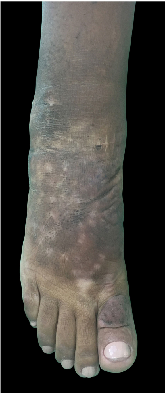
Figure 4 Clinical appearance of the right foot and ankle after 11 months of intralesional corticosteroid therapy. Almost total reduction of nodules and edema, making the appearance resemble the contralateral foot.

A clear decrease of non-depressible edema and nodules was observed, improving the coloration of the affected skin, allowing the patient to wear shoes that she was previously unable to due to her condition (Figs. 4 and 5).