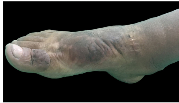
Figure 5 Clinical appearance of the right foot and ankle after 11 months of treatment with intralesional corticosteroid therapy. An important reduction of nodules and cutaneous texture is observed.

Graves' disease is triggered by the emergence of antibodies against TSH receptors. Exophthalmia, acropathia, and