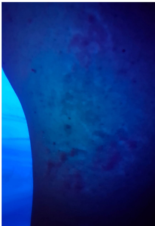
Figure 3 Wood's lamp examination shows diffuse repigmentation pattern.

Although there is evidence supporting the use of pre and postsurgical phototherapy to improve outcomes in the surgical management of vitiligo, we can consider NCES without phototherapy as monotherapy for situations such as SOT patients, in which UV exposure is contraindicated.