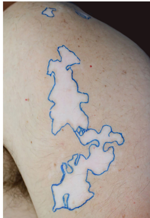
Figure 1 Achromic patches with blaschkoid distribution demarcated on the left arm (24 cm 2 ).

The recipient site was delimited (Fig. 1) and prepared by superficial dermabrasion under local anesthesia (lidocaine 1% without epinephrine). The cell pellet was resuspended in 1.5 mL of normal saline and transferred to the recipient site. A collagen sheet, petrolatum gauze, regular gauze, and