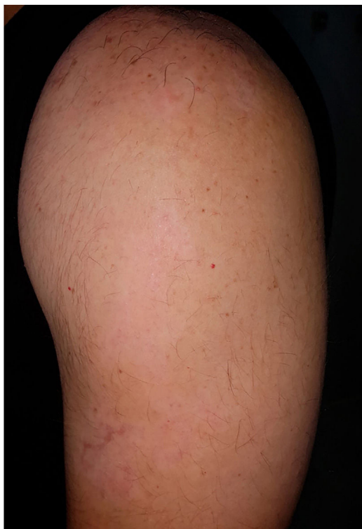
Figure 2 Repigmentation on 95% of recipient site after six months with slight hypochromia.