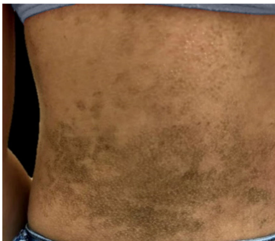
Figure 2 Hyperkeratotic brownish plaques with a dotted pattern affecting the back.