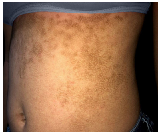
Figure 1 Hyperkeratotic brownish plaques with a dotted pattern affecting the abdomen.

“Terra firma-forme” is a Latin expression, which means “solid earth”, also known as Duncan’s dirty dermatosis. It is a benign and idiopathic skin disorder that was described in 1987. 1–3 Its prevalence and incidence are unknown, because it is an underdiagnosed disorder. 1 The cases described in the literature have indicated greater involvement during childhood and adolescence. 2,3