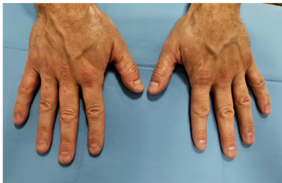
Figure 1 Symmetric macules of vitiligo on the dorsomedial part of the hands.

A 61-year-old man presented with a three-month history of symmetric depigmented lesions on the hands and perilabial region (Figs. 1 and 2). No other anatomical area was