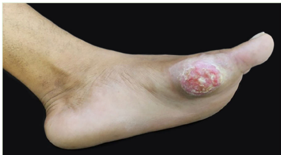
Figure 1 Exophytic and ulcerated tumor lesion.

DFSP is a rare mesenchymal tumor with low rates of aggressiveness. It presents slow progression, with high rates of local recurrence and rare cases of distant metastases. An American study conducted between 2000 and 2010 found an incidence of 41 cases in 10 million patients. 3 Some studies