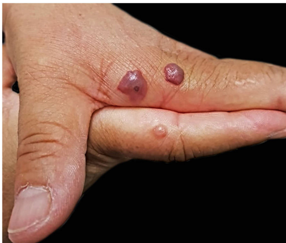
Figure 3 Blisters on the hands of a patient who identified the stings as being from horseflies. Some have hemorrhagic content and a central point where the bite occurred.