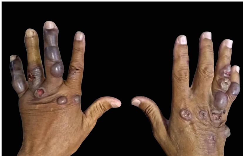
Figure 2 Blisters of hemorrhagic content on the hands of a patient who reported insect bites, but did not identify the aggressor. Note the extent of the lesions.

A female patient, university professor of Biology, stung by horseflies during fieldwork – the insects were identified by