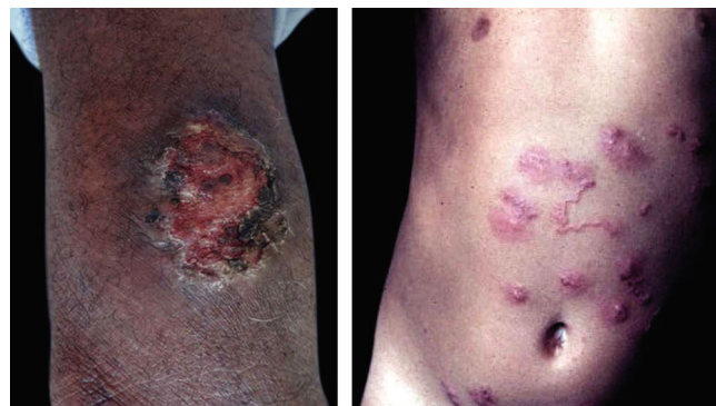
FIGURE 3: Left: cutaneous leishmaniasis with 1-year course in a patient going to the forest. Right: larva migrans in a colony's child

defecate and urinate. Over time, hookworms' larvae occupied passageways and the sand of local beaches. Added to this fact, countryfolks walk barefoot most of the time, what lead to a currently uncontrolled outbreak, reflecting in the statistics of the consultations (Figure 3). For certain, the number of people affected is higher than what we observed, but the monthly consultations hindered a more accurate assessment of the incidence of this problem. 6