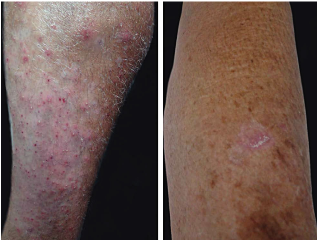
FIGURE 4: Left: typical fishermen folliculitis, who keep their legs constantly moist while loading and unloading the boats. Right: actinic keratoses in a fisherman, uncommon in the sample studied

marriages are not common in the community since the number of inhabitants is not that small, and there is some contact with other colonies via boat trips before the advent of roads.