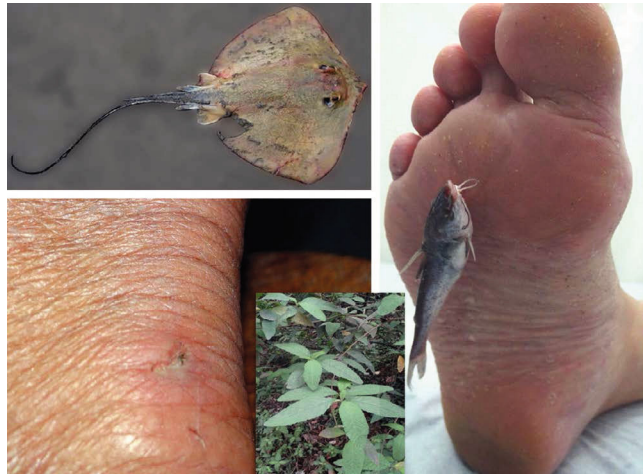
FIGURE 2: Left: marine stingray and injury in a colony's fisherman. Right: injury caused by a catfish. Close up: erva-baleeira or black sage ( Cordia verbenacea ), used in alcohol solution for control of pain and inflammation caused by envenomations

Putting together both the pediatric and adult patients, nine active cases of larva migrans were seen. This is important because larva migrans is one of the parameters that demonstrates loss of the village's customs. The disease did not exist in the colony's beaches and appeared about 10 years ago, with the higher influx of tourists in the beaches' sands. Pets followed their owners and used the sand to