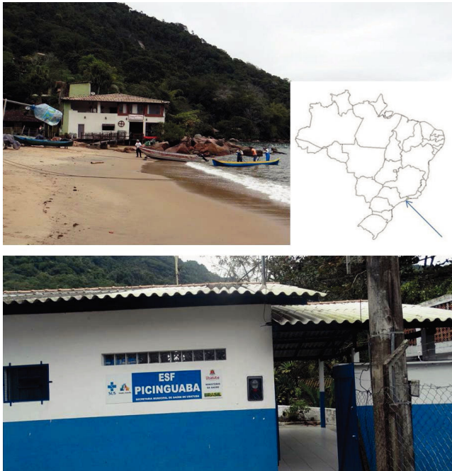
FIGURE 1: Top: view of the Picinguaba beach. Bottom: local Health Center and map with the location of the colony in Brazil

identify the main dermatoses in the community and compare them to other populations, besides evaluating their frequency and their specific relationship with the community.