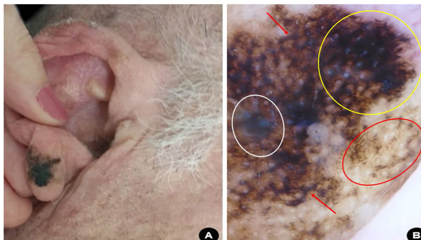
Figure 4 (A), Asymmetric, blackened macula on the right ear lobe. (B), Dermoscopy suggestive of superficial spreading melanoma: bluish-white veil (white circle), homogeneous area with obliterated hair follicles and irregular streaks (yellow circle); rhomboidal structures (red arrow); circle within circle (red circle).