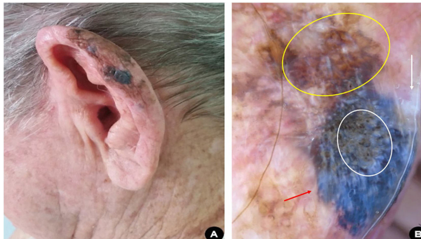
Figure 3 (A), Pigmented, multicolored, asymmetric lesion, with slightly elevated areas on the helix of the left ear. (B), Dermoscopy suggestive of superficial spreading melanoma: blue-white veil (red arrow); irregular dots and globules (white circle); area with rhomboidal structures and asymmetric pigmentation of follicular ostia (yellow circle); white depigmentation area (white arrow).