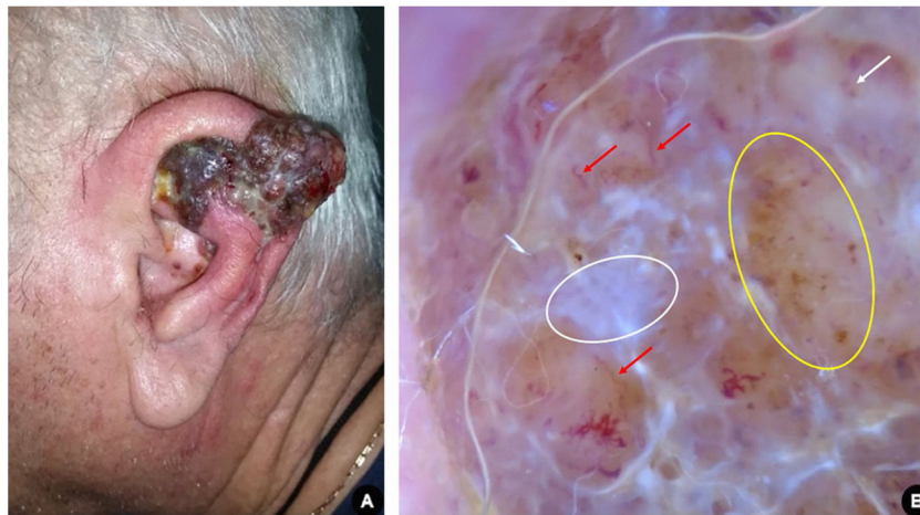
Figure 2 (A), Erythematous-violaceous exophytic tumor affecting the left ear helix with the presence of confluent satellite papules. (B), Dermoscopy suggestive of nodular melanoma: bluish-white veil (white circle); atypical vascular pattern, with irregular linear vessels (red arrows) and milky red globules (white arrow); irregular dots and globules of asymmetric distribution (yellow circle).