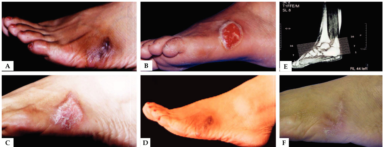
FIGURE 2: A) Eumycetoma – Madurella mycetomatis . B) After deep surgical debridement. C) 30 days after surgical procedure. D) Six months after surgical procedure. E) Magnetic resonance imaging (MRI) of the tumor. F) Patient after mycological and clinical cure

Several imaging techniques can be used to determine the extent of lesions, including conventional X-rays, ultrasonography, magnetic resonance and computed tomography. 5,7,15 These radiological images are essential for surgical planning. 20