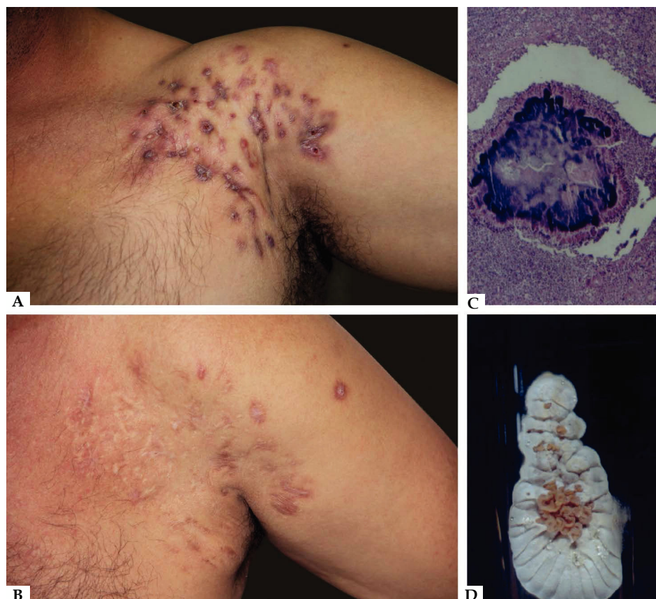
FIGURE 1: A) Actinomycetoma - Nocardia brasiliensis . B) After clinical and surgical treatment. C) Actinomycetoma grain on histopathology (Hematoxylin & eosin, X40). D) Typical colony of Nocardia brasiliensis

Histopathology shows granulomas of epithelioid cells and multiple giant cells. In the eumycetoma, the grains are characterized by clusters of branched hyphae radially arranged that occasionally forms vacuoles. Pink, sharp, large hyphae can be seen, surrounded