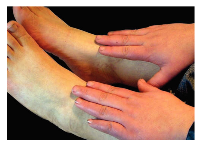
FIGURE 4: Acrocyanosis on both hands with slight livedo reticularis in the dorsal aspect. Feet are not compromised