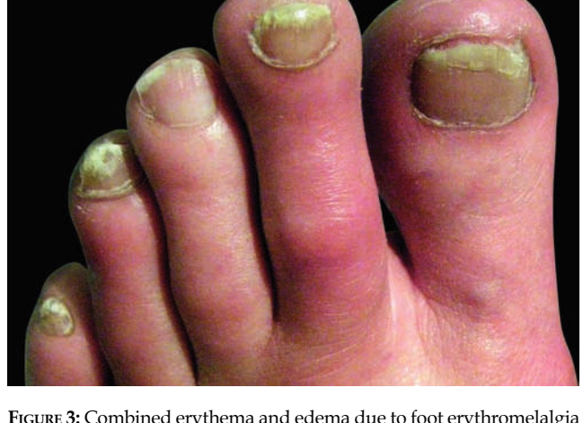
FIGURE 3: Combined erythema and edema due to foot erythromelalgia

ary infection followed by fissures, blisters, painful ulcers, cyanosis, gangrene or necrosis. Many patients know that burning pain is relieved with cold water or ice, an electric fan or staying in places with low temperature. Some of these methods lead to skin maceration followed by epidermis slough thus increasing the damage to the skin barrier. Cold could trigger long lasting vasoconstriction provoking ischemia and tissue necrosis, what could be interpreted by patients as aggravation of the disorder. Cutaneous dystrophies could increase pain and at the same time slow skin repair, deteriorating their quality of life and leading to social isolation, and in case of hypothermia adding a life-threatening risk. The patient must be advised to discontinue these practices. Some patients could develop skin automutilation behavior; although its mechanism is unknown, the poor quality of life could be related to this condition.<sup>2,18,32,34,36,62,66</sup>