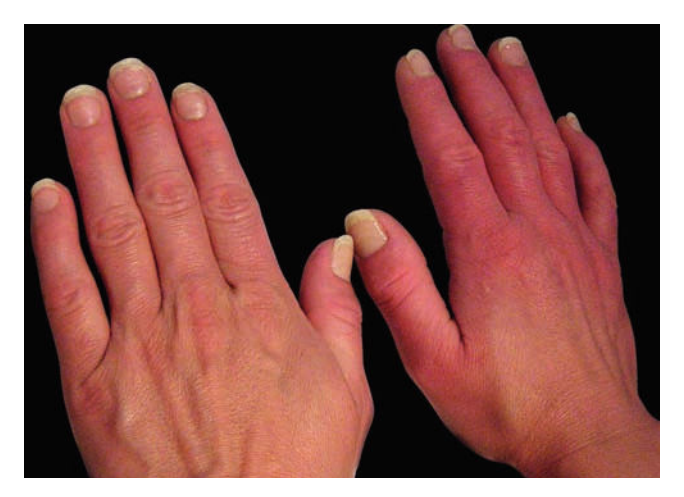
FIGURE 2: Erythema and edema on both hands, more pronounced on the right