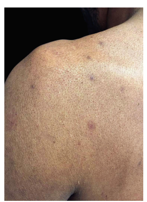
FIGURE 2: Brown colored erythematous nodules of 0.5-1.0 cm in size located on the proximal part of the upper limbs

he attributed to repeated traumas at work. Dermatological examination revealed nodules of 0.5-1 cm on the upper limbs and poorly delimited irregular brownish spots on the trunk, back (Figures 1 and 2), and lower limbs, in addition to an ulcer on the left knee with an infiltrated, raised and keratotic border with granular erythematous floor, of approximately 7cm in size (Figure 3).