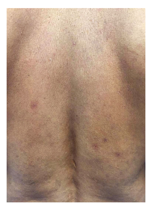
FIGURE 1: Irregular and poorly delimited brownish macules and spots on the back