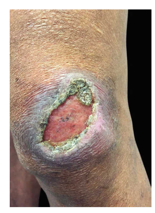
FIGURE 3: Ulcerated plaque of approximately 7cm in size, with granular floor and raised and keratotic border on the left knee

We investigated the diagnostic hypotheses of type II reaction of leprosy and ACL. We initiated treatment with thalidomide 100mg/daily and prednisone 40mg/daily for the reaction, and requested PCR and culture for leishmaniasis, with a positive result