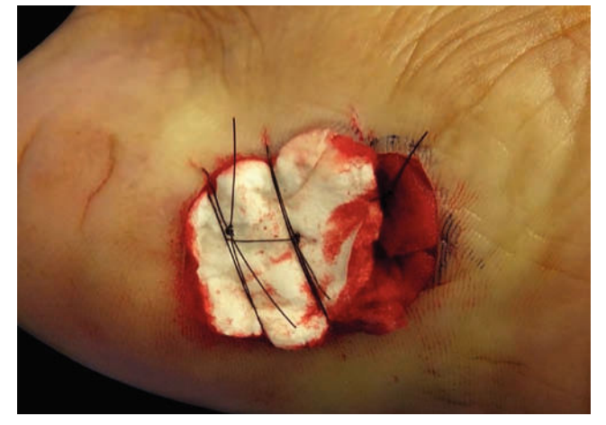
FIGURE 3: Immediate post-operative period, dressing with sterile absorbable gelatin sponge. Suture performed only to fix the sponge during the first two days

Although the interphalangeal regions of the digits correspond to the most affected sites, the palmoplantar region can also be affected, as well as wrist, elbow, knee, ankle, and calcaneal re-