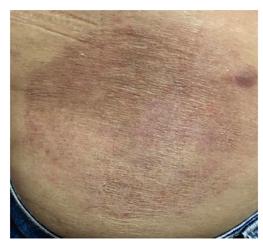
FIGURE 4: Lesion after treatment

phyton. Non-specific, cellular and humoral immunologic responses act in an attempt to block infection in the host.<sup>1</sup>