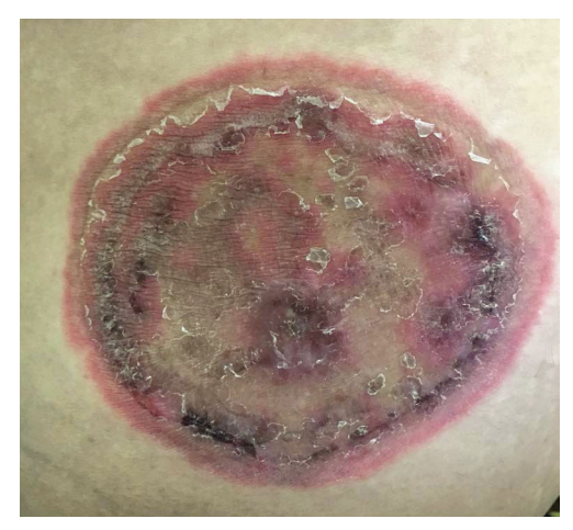
FIGURE 1: Round plaque with well-defined borders and figurate center

The dermatophytes comprise 3 genera of fungi capable of invading keratinized tissues: Trichophyton, Microsporum, Epidermo