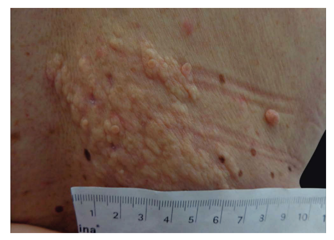
FIGURE 1: Subtly yellow plaque, made by multiple pedunculated and confluent papules on the right infrascapular region