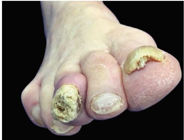
FIGURE 1: Clinical examination. Third toe with important onychodystrophy and an erythematous nodule on the proximal nail border

Onychomatricoma is a rare, slow-growing neoplasm of the nail matrix – asymptomatic in most cases – that may rarely present with pain. 2,3 It mainly affects Caucasian women around the age of 50. It is more common on the fingers than on the toes. However, this conclusion is questionable, since it is an asymptomatic lesion, and consequently, its alterations tend to be more noticeable when they occur on the fingers. 2,3,4 Classically, it manifests itself with the formation of a nail plate of variable thickness, accentuation of the transverse curvature, splinter hemorrhages in the proximal portion,