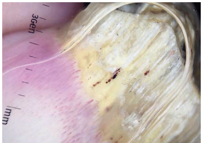
FIGURE 2: Dermoscopy. Splinter hemorrhages, xanthonychia, and white transverse lines