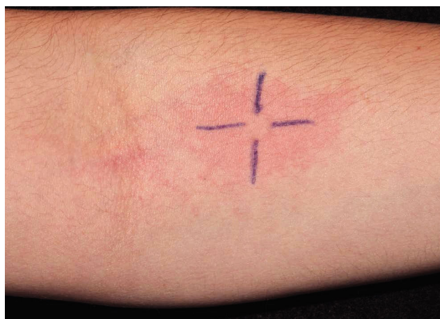
FIGURE 1: Flare and wheal triggered by histamine test. Representation of the measurement of the wheal with a pen

In the subsequent tests, the same procedure was performed two hours after the intake of one of the commercial AH of the following brands: dexchlorpheniramine 6mg (Polaramine), hy-