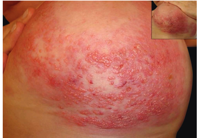
FIGURE 1: Inflammatory breast cancer. Clinical presentation

Dermoscopy showed multiple grouped white-to-yellow rounded milia-like cysts over an erythematous background and irregular linear vessels over and between them (Figure 2). A skin biopsy of one of these milia-like cysts was performed. Microscopic examination showed multiple dermal intralymphatic emboli of a primary comedo-type ductal breast carcinoma (inflammatory carcinoma). Therefore, we reached the diagnosis of inflammatory breast cancer (IBC) (Figure 3).