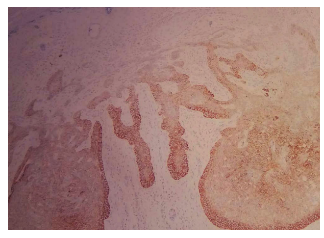
FIGURE 5: Positive staining for Ber-EP4 (X100)

Due to almost exclusive occurrence on hair-bearing skin, it has been long postulated that the original cell population of BCC