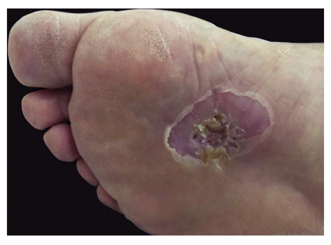
FIGURE 1: Ulcerated plaque on the cavum of the right sole

A 65-year-old woman was referred to the dermatology clinic to treat a non-healing ulcer on the sole of the right foot that had been present for 2 years. There was no history of trauma, exposure to noxious agents (especially arsenic or tar), nevoid basal cell carcinoma syndrome, or xeroderma pigmentosum. There was no family history of skin tumors or hereditary diseases.