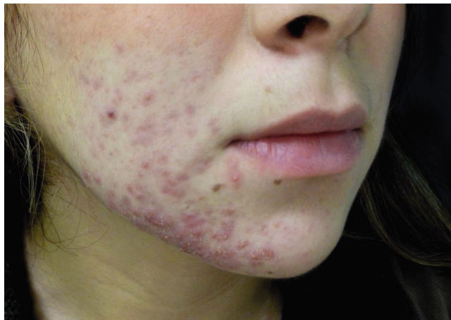
FIGURE 1: Unilateral papules and pustules in the mandibular area