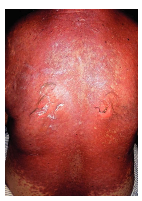
FIGURE 1: Detachment of the epidermal surface

Early withdrawal of the suspected drug is essential. Patients should be managed in highly specialized centers, such as burn