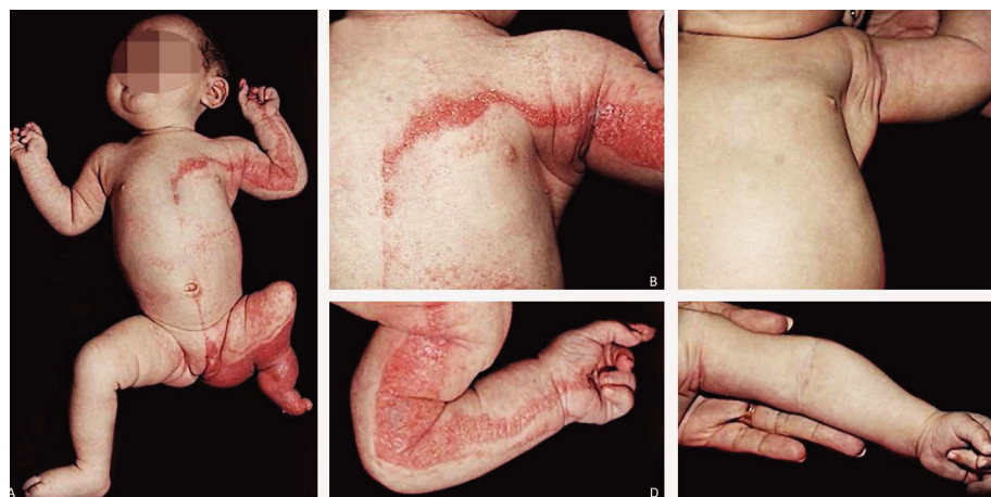
FIGURE 1: A - CHILD syndrome: typical unilateral segmentary lesion with lower limb hypoplasia. B, C, D, and E - Trunk and upper limb lesions before and during treatment

Further research on lipid metabolism of the skin might lead to more effective treatments of CHILD syndrome and other keratinization disorders. □