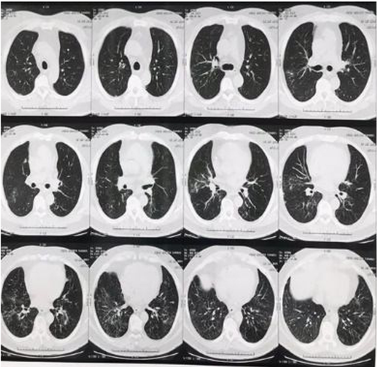
Figure 1 Bilateral pulmonary infiltration characterized by ground-glass opacities and fine reticulation with a basal predominance. Nodular and ground-glass opacities with sparse centrilobular distribution, more evident in the middle lobe.