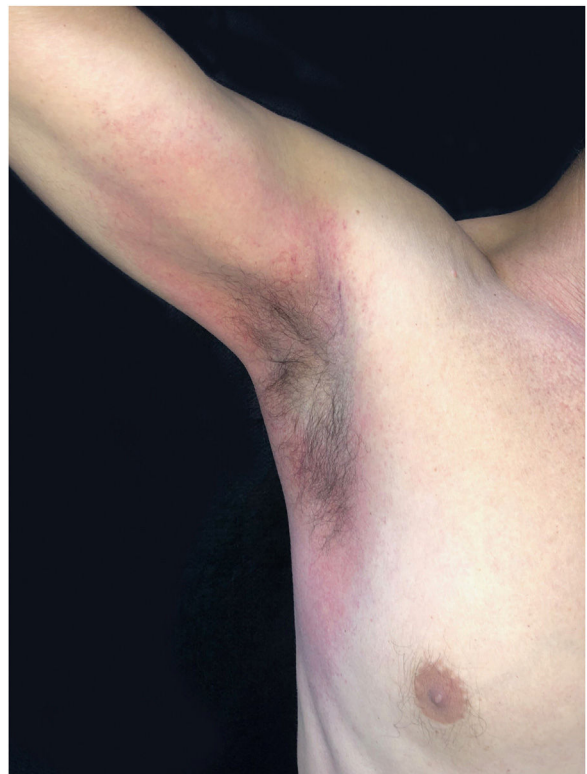
Figure 2 SDRIFE: evidence of axillary involvement.