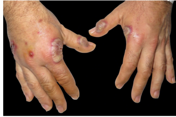
Figure 1 Clinical presentation. Erythematous-violaceous plaques, pustules, and bullous lesions on the dorsal hands.

The patient was treated with oral prednisone 30 mg daily in a slow-tapering regimen for 8 weeks, along with topical betamethasone/gentamicin cream. Steroid therapy induced a dramatic response of both cutaneous lesions and thoracic pain. Moreover, the patient achieved to stop using cocaine since hospitalization to this day. During 1-year follow-up, no recurrence of the cutaneous lesions was observed, and the patient remained completely asymptomatic.