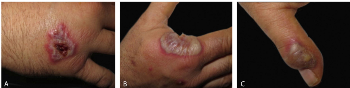
Figure 2 Detail of individual lesions of neutrophilic dermatosis of the dorsal hands (A), Crusted violaceous plaque (B), Large blister with an erythematous base on the radial aspect of the right hand (C), A lesion with purulent discharge over interphalangeal joint of the left hand.

NDDH is currently considered an uncommon, localized variant of SS. 4 Clinically, NDDH is characterized by erythematous-violaceous plaques and nodules, frequently ulcerated, predominantly involving the dorsal hands. 4 This disorder has a predilection for the radial aspect of the hands and is generally bilateral. 5 The localized distribution, clinical features and neutrophilic infiltration often lead to the initial diagnosis of cutaneous infection. However, the lesions do not respond to antibiotics and cultures are negative. 4