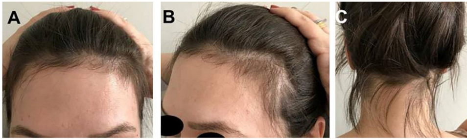
Figure 1 Case 1: (A), Frontal fringe. (B), hair rarefaction on the temporal region and (C), occipital fringe of hair regrowth after effluvium in the post-partum period.