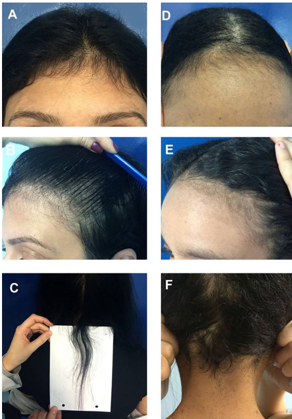
Figure 4 Case 4: (A), Frontal fringe. (B), hair rarefaction on the temporal region and (C), occipital hair regrowth fringe after a serious car accident; Case 5: (D), Frontal fringe, (E), temporal rarefaction and (F), occipital hair regrowth fringe post-effluvium after severe intestinal infection.

Knowledge of the clinical signs of hair regrowth after telogen effluvium can help in this differential diagnosis. As the frontal and temporal regions of the scalp have a greater