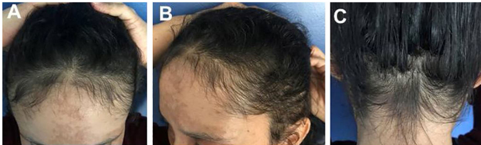
Figure 3 Case 3: (A), Frontal fringe. (B), Hair rarefaction on the temporal region and (C), occipital hair regrowth fringe after effluvium post-weight loss.

occipital area revealed several short hairs whose ends show these characteristics.