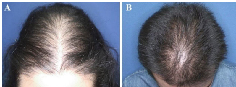
Figure 2 Hair loss patterns observed in pediatric androgenetic alopecia. (A), "Christmas tree" pattern in a female with adolescent androgenetic alopecia. (B), Bitemporal, frontoparietal and vertex thinning in a male with adolescent androgenetic alopecia.