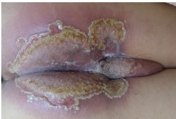
Figure 1 Initial clinical aspect with perianal and intergluteal erosion with circinate pustular edges and some isolated pustules.