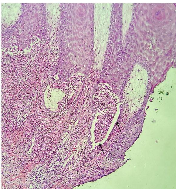
Figure 2 Light microscopy showing clefts and polymorphonuclear microabscess (Hematoxylin & eosin, \times 150 ).

cesses of inflammatory cells (neutrophils and eosinophils) (Fig. 2). In some microscopic fields, clefts with isolated keratinocytes next to microabscesses were observed (Fig. 3).