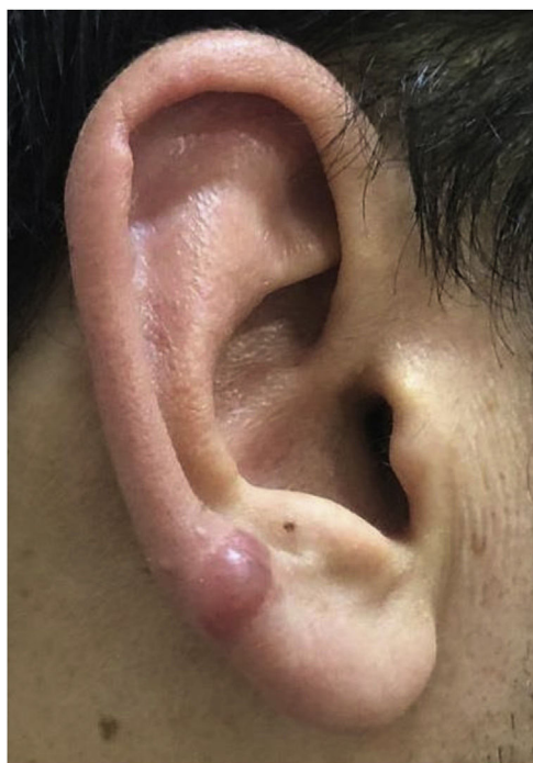
Figure 2 Keloid formation following piercing through the transitional zone in patient 3.