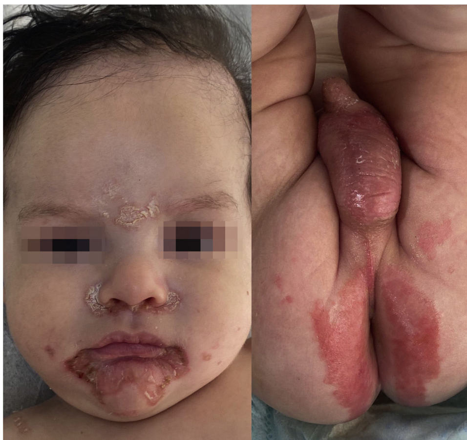
Figure 1 Erythematous-desquamative lesions in the perioral, perinasal, glabella and genital regions.

Zinc deficiency can be either genetic or acquired. The genetic forms are autosomal recessive, known classically as acrodermatitis enteropathica, or autosomal dominant called TNZD. 2 In acrodermatitis enteropathica, the mutation occurs in the SLC39A4 gene, and the incidence of this mutation is estimated at 1/500,000 children without predilection