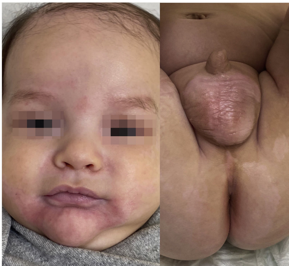
Figure 2 Three weeks after zinc supplementation, the patient showed significant improvement.