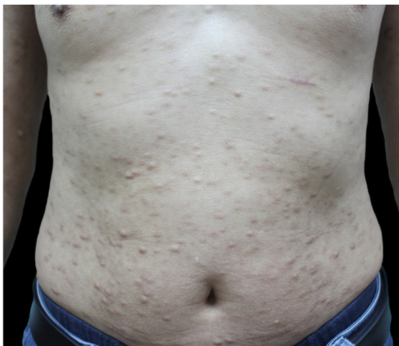
Fig. 3 Continuous effects after eight months of treatment with tofacitinib.

Initial treatment with methotrexate at a dose of 15 mg/week was discontinued after three months, as the disease progressed, and new nodules appeared. Thereafter, mycophenolate mofetil at a dosage of 1 g twice daily was started. Three months later, the patient still had no observable effect. Thus, he was switched from prior treatment to tofacitinib. At the outpatient follow-up, the patient had not developed new lesions, while the pre-existing nodules were found to be smaller and less firm with continuous effects after eight months of treatment with tofacitinib (Fig. 3). He is still being followed up and has not experienced any adverse side effects.