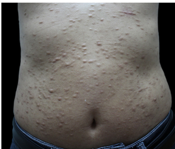
Fig. 1 Clinical presentation before treatment with tofacitinib.

A 48-year-old man presented to the dermatology clinic with a 1-year history of systemic sclerosis (SSc) and was given a low-dose steroid of 20mg prednisone orally per day for treatment of the disease. He presented clinically with diffuse skin hardening and tightening, as well as Raynaud's phenomenon and fulfilled the diagnostic criteria of the ACR criteria. Three months ago, he developed multiple indurated and exophytic nodules over the trunk, scattered over the lower and upper extremities, with sparing of the face. The lesions became progressively harder and more numerous and increased in size. The physical examinations demonstrated multiple, firm, raised, skin-colored nodules on the chest, abdomen, and back, and scattered over extremities (Fig. 1). The laboratory tests revealed an elevated ery-