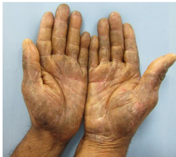
Figure 1 On examination, erythematous, brownish plaques with lichenification, desquamation, erosions and fissures are observed on the hands.

The findings corroborated the diagnosis of ACD with an occupational link, with lettuce being the causal agent. The