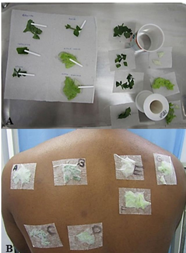
Figure 2 (A) Preparation of leaves with bidistilled water for the prick-by-prick test on the left and contact test on the right. (B) Application of leaves for the contact test identified by letters: (A) Coriander; (B) Chives; (C) Parsley; (D) Watercress; (E) Iceberg lettuce stem; (F) Iceberg lettuce leaf; (G) Leaf and stem of green-leaf lettuce.

In the case of allergy to lettuce, the test with SLs can be used as a type of screening, since the mix does not contain the two substances that have been proven to be allergenic: lactucin and lactucopicrin. 2 The diagnosis can be made by patch testing with both at a concentration of 1% in petrolatum, a short ether extract of lettuce at 10% in petrolatum, or the fresh plant and sap. Some authors propose the inclusion of lactucopicrin in a new SL mix (SL mix II). 7