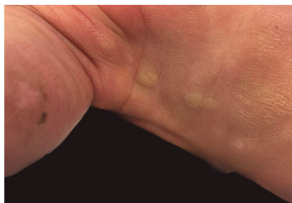
Figure 2 Erythematous brownish plaques on lower limb, topped by blisters at different stages of development (stray blisters, flaccid blisters and exulcerations).