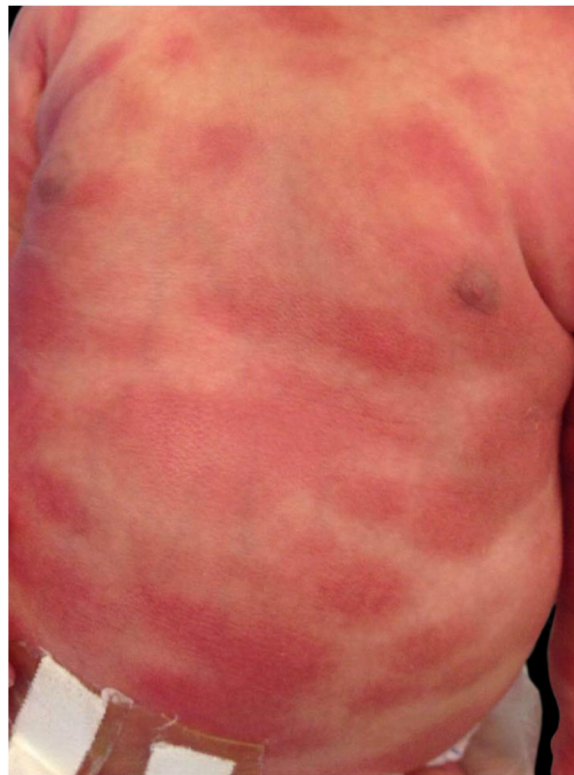
Figure 1 Erythematous plaques present at birth.

At that moment, prednisone 1 mg/kg/day was introduced and a skin biopsy performed. The skin biopsy revealed numerous of diffuse mast cells cutaneous infiltrates stained in metachromically toluidine blue staining, confirming the diagnosis of mastocytosis (Fig. 3). Immunohistochemistry CD117 (c-kit) evidenced massive positivity of mast cells